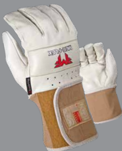
ELG2005 MEC-FLEX VIBRAPLUS ANTI-VIBRATION Mec-Flex Series Glove